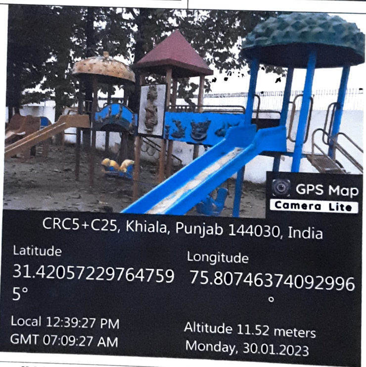
Figure: Facility for small kids in Day Care Center

M.S. Registrar Sant Baba Bhag Singh University Vill-Khiala, Jalandhar-144030